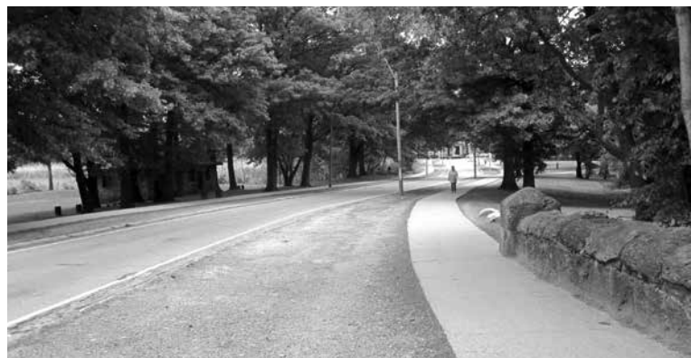
We've got different cars, certainly, and an abundance of new development. But it's still possible to find pockets of history in the neighborhood that are somewhat untouched by the whips and scorns of time. Photo 1 shows an early view of Boylston Street from roughly where Jerry Remy's now stands. Photo 2 shows Agassiz Road, once nicknamed "the Speedway." Photo 3 shows a police wagon about 1925 on Park Drive (then known as Audubon Road) and the same view today.